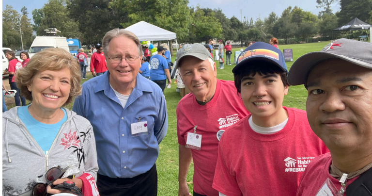
Walls of Hope LCPC team

Walls of Hope event to launch its rebuilding program in Altadena