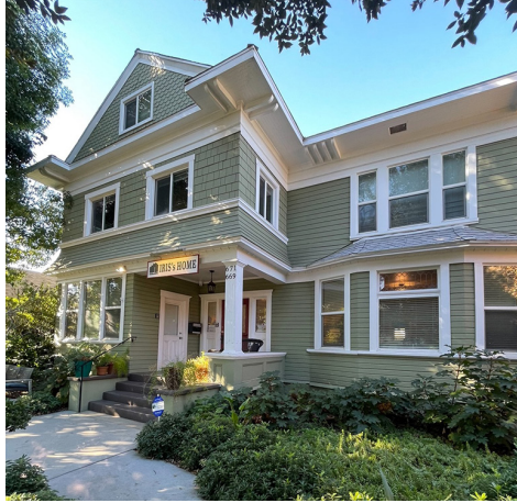
Door of Hope multi-family shelter

As mentioned previously, we have been supporting DOH families who lost their homes in the fire as they transition into new, rental housing. We use a small portion of the money we raised to procure items on a family's